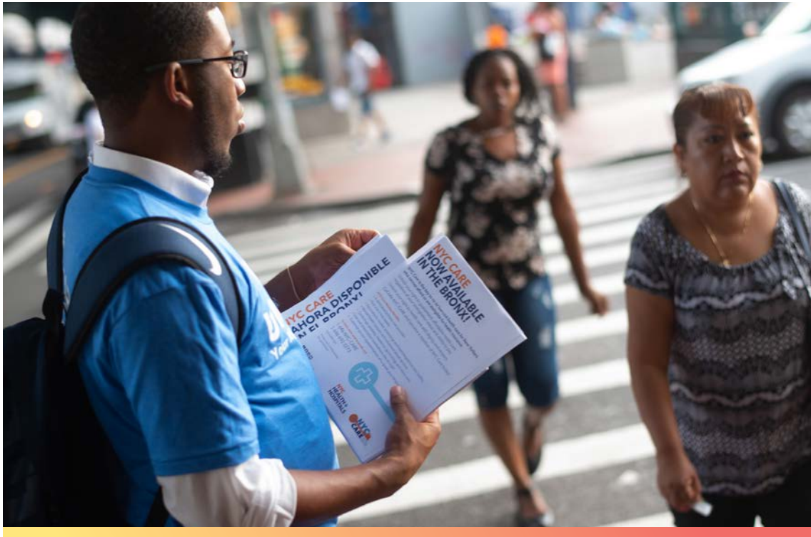
New York City rapidly expanded NYC Care to all five boroughs, providing another opportunity for people to connect to mental health services during the pandemic.

of these programs, DOE and philanthropic partners could support states to fund healing-informed training in school districts. Partnerships with professional organizations and state certification bodies could be used to increase the reach of healing-informed training for educators.