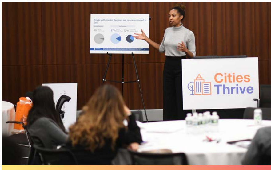
Local, state and federal governments across the United States need to lean on and learn from one another.

To promote lifelong mental health for young people, early intervention is crucial. 18 To deliver support early and often in a child’s life, NYC introduced a social-emotional learning (SEL) curriculum into all public schools for students from pre-kindergarten through 12 th grade. 16 The curriculum includes didactic and experiential components to develop social, emotional, and behavioral regulation skills. Supports for parents and caregivers are emphasized to break cycles of intergenerational mental health stigma and trauma. The use of SEL curricula in other jurisdictions is associated with improved mental health outcomes, academic performance, and school attendance, as well as reduced disciplinary incidents. 19 In the context of COVID-19, from which children and youth are under acute emotional duress, 20 building mental health promotion into education can equip young people to cope with distress caused by the pandemic.