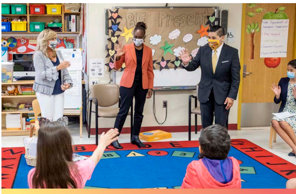
Social and Emotional Learning is teaching every New York City student how to process their emotions and grow into happy, healthy adults.

Although state and local governments control the operations of US public education, the US Department of Education (DOE) has considerable influence as a funding and standard-setting body to promote and support the integration of mental health care into education nationwide. The following strategies will help the nation prioritize youth and support the mental health of young people as a preventive investment in the future.