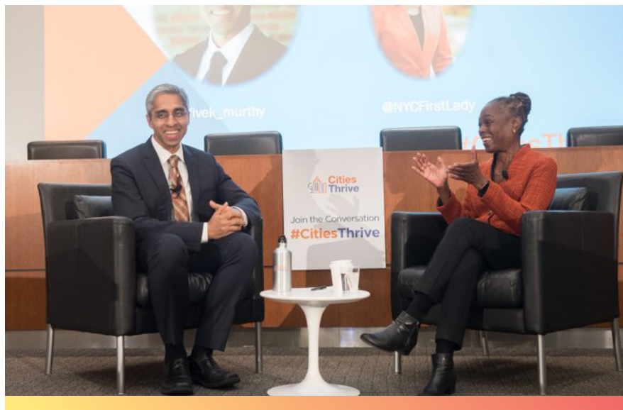
Collaboration between the public, private and advocate sector improves our neighborhoods in ways government can't do alone. Pictured: Former United States Surgeon General Vivek Murthy and First Lady of New York City Chirlane McCray during the 2019 Cities Thrive Conference

In 2015, New York City (NYC) launched ThriveNYC, a mental health policy platform that positioned mental health equity at the center of urban governance and established a portfolio of initiatives to expand access to preventive and direct mental health care. In parallel to ThriveNYC, a consortium of over 220 municipal and county governments, led by NYC, have formed the Cities Thrive Coalition and pledged to elevate mental health as a central policy issue in their jurisdictions. Through the Coalition, cities worldwide have built out municipal mental health policy in the model of ThriveNYC, notably ThriveLDN in London and Mind Shift in Stockholm. 12 The goals and programs that guide and comprise ThriveNYC and the Cities Thrive Coalition are described in detail elsewhere, and the full list of ThriveNYC initiatives is available in Appendix B of this report. 13,14