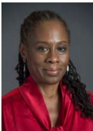
Chirlane I. McCray, ScD (Hon) First Lady of New York City Founder, ThriveNYC

Guided by these innovative local policies to promote population-level mental health at home in New York City and across the county, this report outlines a series of empirically grounded strategies for federal and state policymakers to promote mental health equity in the wake of COVID-19. Our intention is to build on and extend the successes of the Affordable Care Act and the Mental Health Parity and Addiction Equity Act. Using a population-level approach to policymaking, these strategies aim to promote mental health broadly and equitably for vulnerable community members with serious mental illness, for the children and youth who are our future, and for Black and Brown communities that historically have had inequitable access to mental health care. Policymakers and advocates must act as a unified front to improve mental health care and keep our communities safe and healthy. As the pandemic progresses, there is not time to waste. We invite readers to take up our call to action as we all do our part to help one another stay safe during these harrowing times.